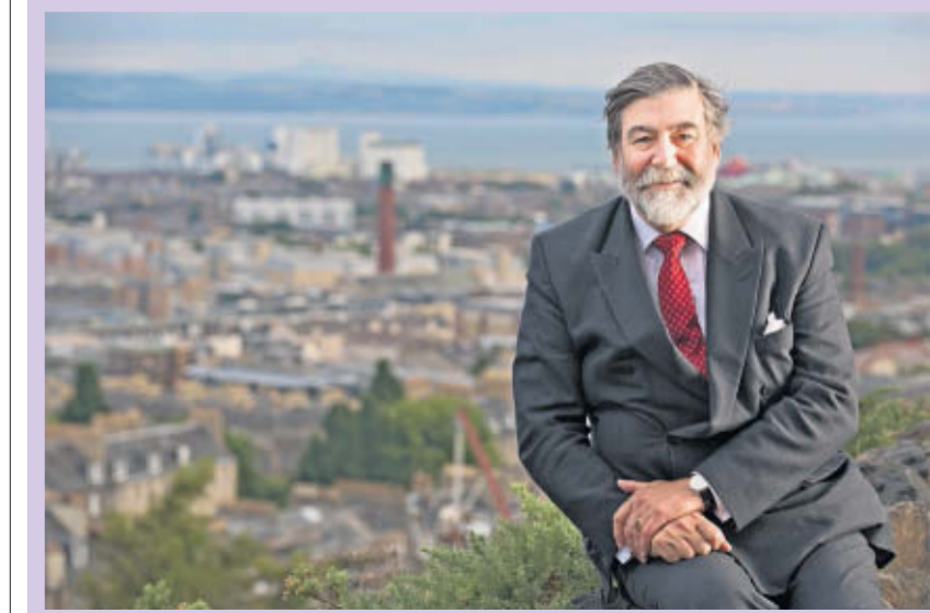
Lord Thurso: "It's lovely to be looked after by somebody else"

Thurso has clearly relished his time at VisitScotland, visiting parts of the country, such as the Outer Hebrides, that he'd never seen before and watching parts of the industry — the whisky tourism sector in particular — evolve and adapt.