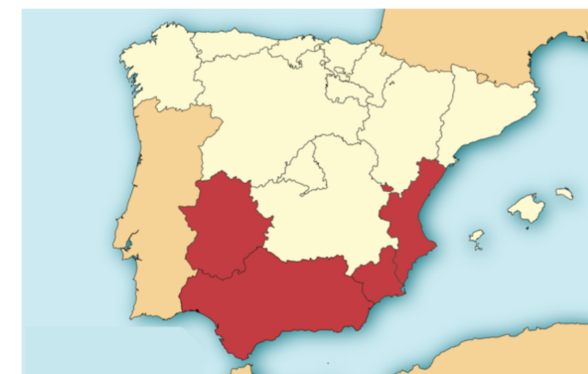
Covered regions (in red)