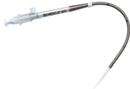
Bio-Medicus™ NextGen Cannulae