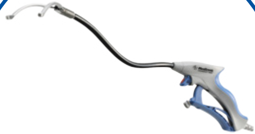
Cardioblate™ Gemini™-S Surgical Ablation Device