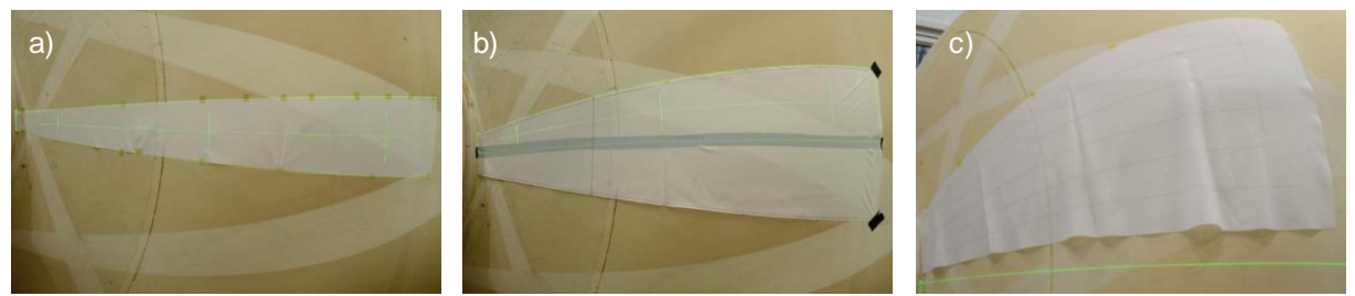
Figure 3. Experimental application result for peel ply: a) for cut piece size 10^{\circ} , b) for cut piece size 20^{\circ} and c) for cut piece size 30^{\circ} .

The amount of wrinkles and the wrinkle pattern is evaluated visually, based on personal experiences. With regard to the wrinkle pattern, several results are obtained. The experiments show differences of the wrinkle pattern while we applied the three materials, peel ply, perforated release film and flow media on the tooling geometry. For the same ply sizes, obviously, less wrinkles appeared within the flow media and the peel ply. Most wrinkles are formed within the perforated release film plies.