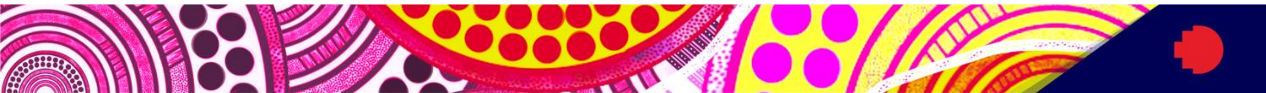
AIATSIS. "Map of Indigenous Australia." AIATSIS . Accessed 27 May 2024. https://aiatsis.gov.au/explore/map-indigenous-australia