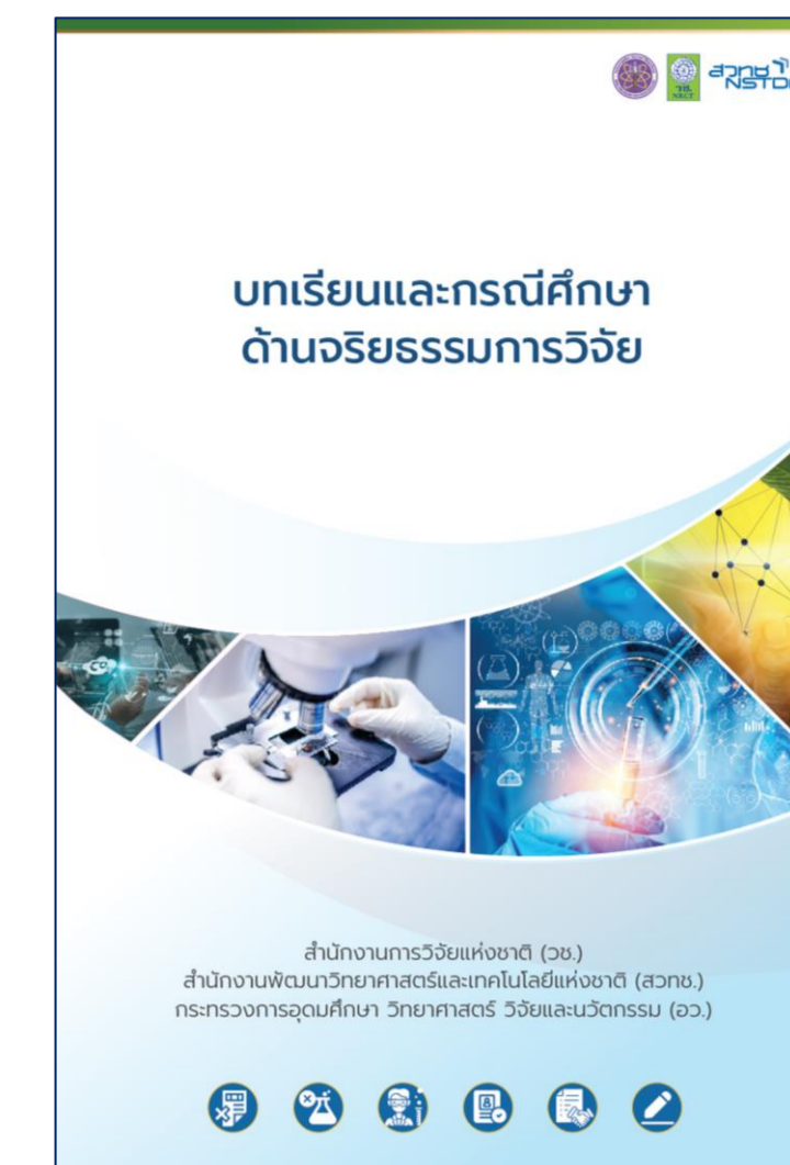
Figure 2 The book about research integrity and case studies