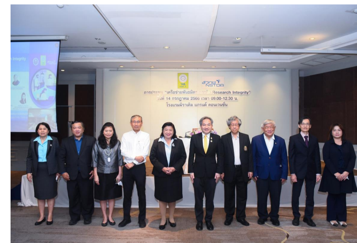
Figure 1 The participants of TH-RIN annual meeting

To develop Thailand Research Integrity Network (TH-RIN) through various activities, such as establishing committee, conducting the meetings, and creating or sharing resources about research integrity.