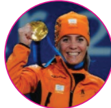
Nicolien Sauerbreij Olympic Gold medal winner, snowboarder, Motivational speaker