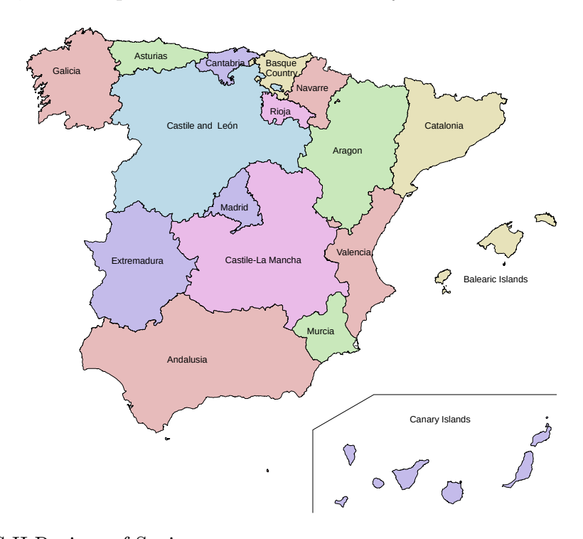
Map 1: NUTS II Regions of Spain

Our data are obtained from the Customs Database, elaborated by the Customs and Excise Department of the Spanish Tax Agency, which covers the universe of exports transactions in Spain. For each transaction, we know the firm's pseudo-identification code, the product at the 8-digit Combined Nomenclature (CN) classification, the destination of the export transaction, the free-on-board (FOB) value in euros of the transaction, and the exported quantity (in weight metric and/or units). The database also reports the fiscal address, at regional level, of the exporter. We use data for the year 2014.