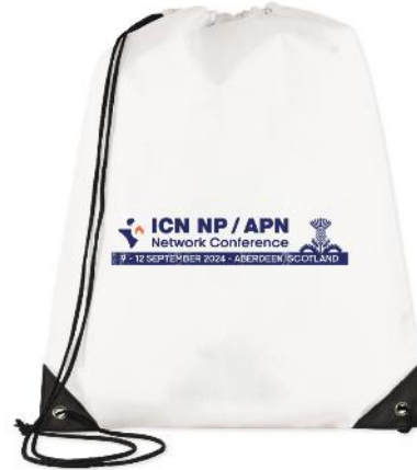
Delegate Bags £2,500+vat