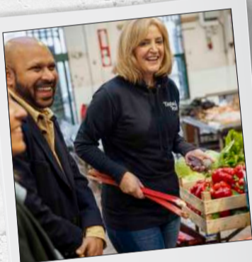
Taste & Tour