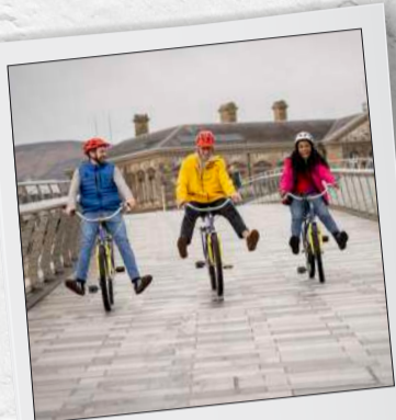
Belfast Bike Tour