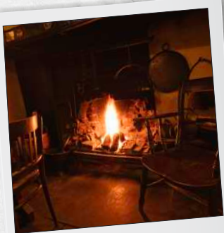
The Crosskeys Inn