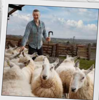
Glenshane Country Farm