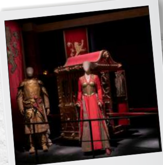
Linen Mill Studios