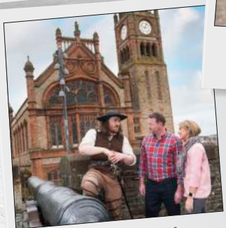
Walls of Derry at The Guildhall