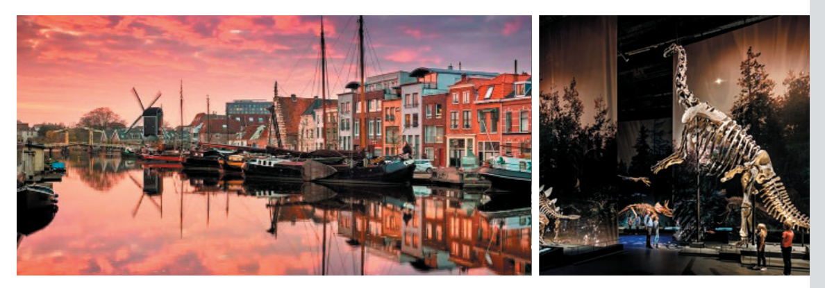
6 | A joint international Conference on Materials in the Space Environment

Naturalis' new museum is a combined experience of seeing and doing. All ages will experience the beauty and richness of nature in impressive galleries. In the new galleries you will learn everything about the earliest life on Earth, about The Netherlands in the Ice Age and about the immense forces of our planet. You will also discover the most surprising ways in which plants and animals seduce each other or look a huge African elephant right in the eyes. Ever wondererd about life in the Dinosaur Era? You no longer have to.