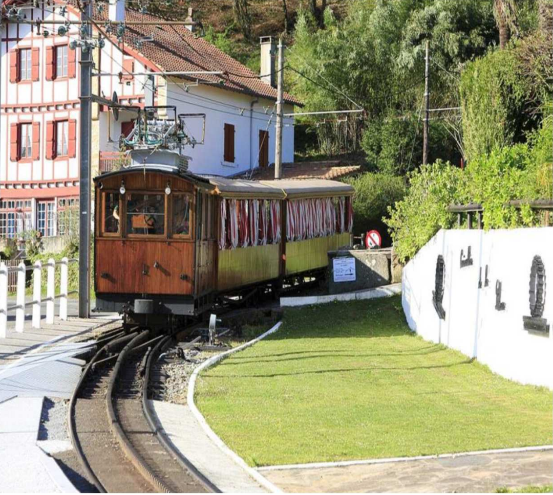
MYTHICAL MOUNTAIN RHUNE EXCURSION