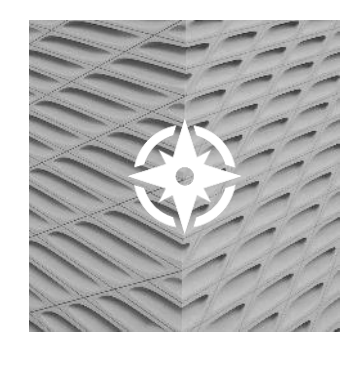
Resilience & Agile

Able to accept changes and adopt new methodologies