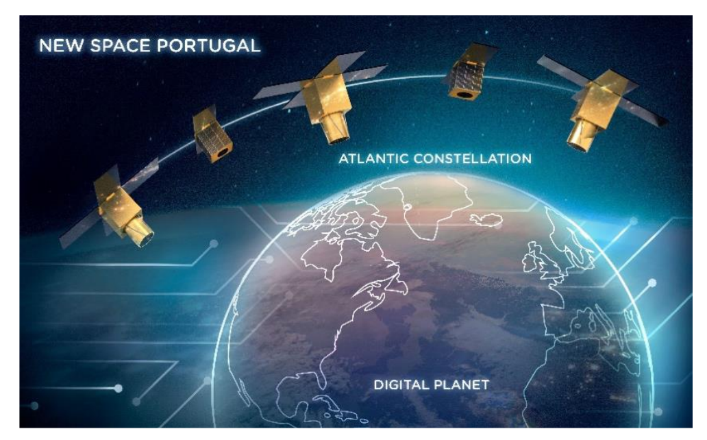
Figure 1 - New Space Portugal artistic view

The New Space Portugal initiative will be an end-to-end system that cover all aspects of the value chain from the upstream segment to the downstream segment as presented in Figure 1 and described below.