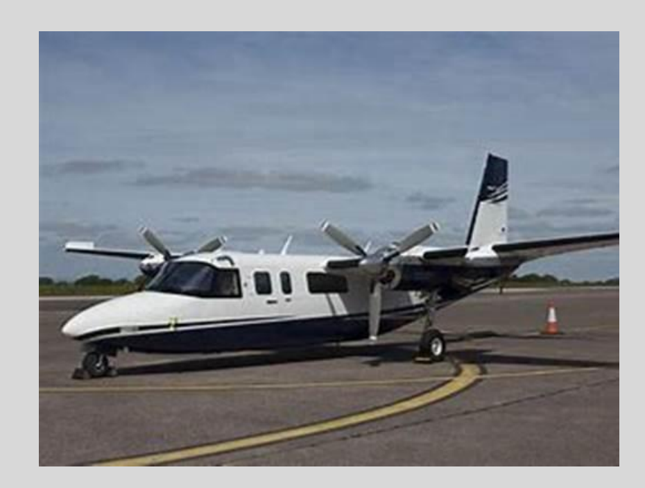
Type of Aircraft - Before