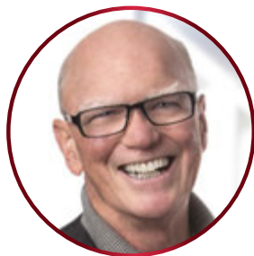
STEWART BAKER HSEG Member Former Assistant Secretary for Policy U.S. Department of Homeland Security