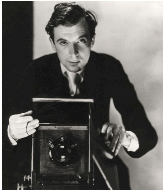
Sir Cecil Beaton