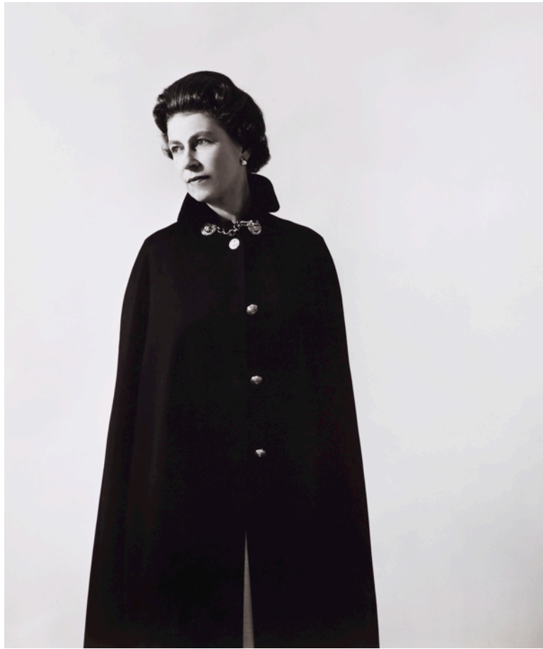
Portrait of Queen Elizabeth II: Sir Cecil Beaton 1968