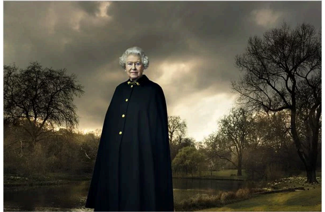
Portrait of Queen Elizabeth II