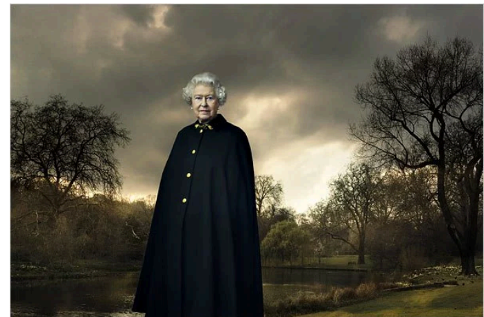
Queen Elizabeth 2007