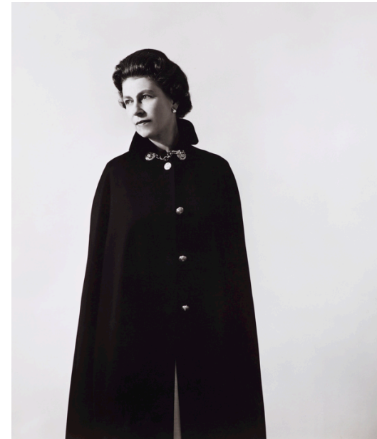
Queen Elizabeth 1968