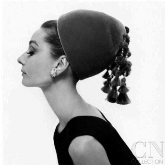
Audrey Hepburn 1964