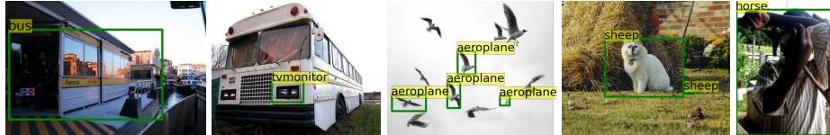
Fig. 3. Examples of failure cases. Our method is often confused with the objects with similar appearances.