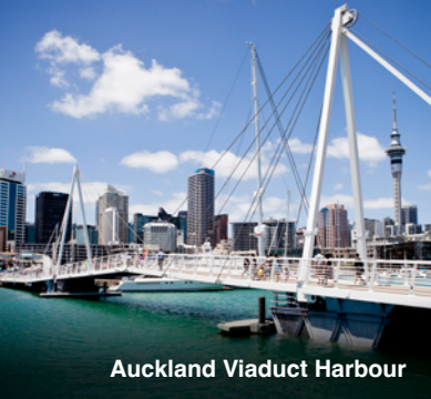
Auckland Viaduct Harbour