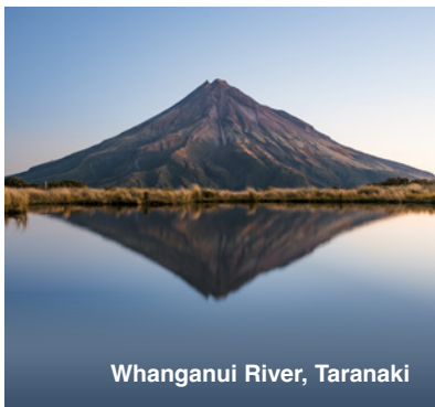
Whanganui River, Taranaki