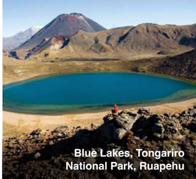
Blue Lakes, Tongariro National Park, Ruapehu