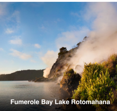
Fumerole Bay Lake Rotomahana