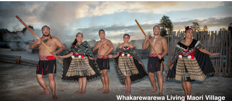
Whakarewarewa Living Maori Village

Discover things to see and do at newzealand.com .