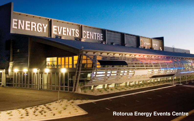
Rotorua Energy Events Centre

A range of accommodation options to suit all budgets are located within easy access to the events centre.