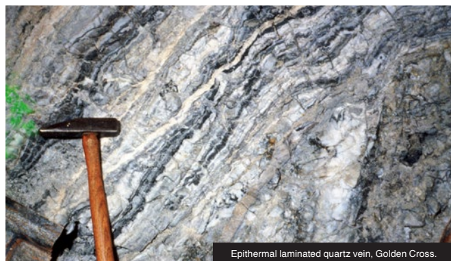
Epithermal laminated quartz vein, Golden Cross.

This course provides participants with a detailed overview of mineralisation and alteration associated with porphyry Cu ( \pm Au \pm Mo) and high sulphidation Cu-Au deposits. Case studies from around the Pacific Rim will be used to highlight the key geological elements of these magmatic-hydrothermal systems that inform genetic models and aid mineral exploration.