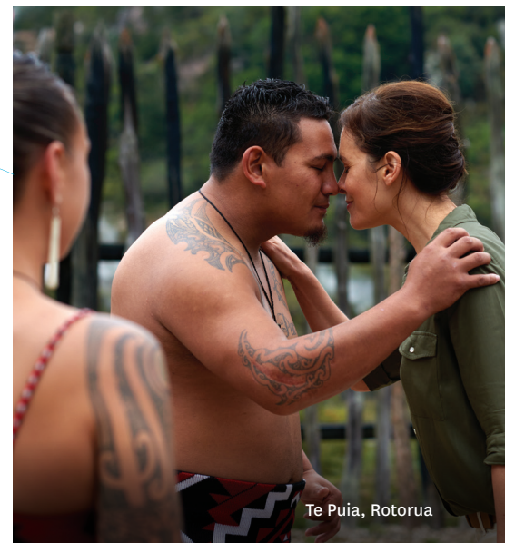
Te Puia, Rotorua

For more information contact Conferences and Events: sga2021@confer.co.nz W: www.sga2021.org