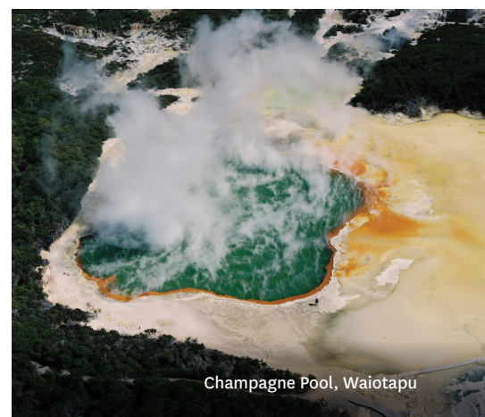
Champagne Pool, Waiotapu