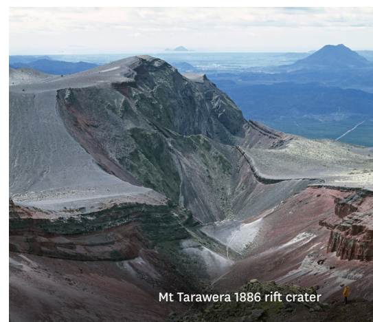
Mt Tarawera 1886 rift crater

For more information contact Conferences and Events: sga2021@confer.co.nz W: www.sga2021.org