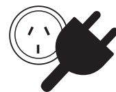
One standard power feed (Max 5 amps loading)