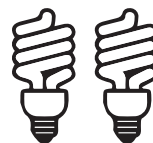
Two 150 watt spotlights