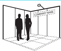
3m x 3m booth