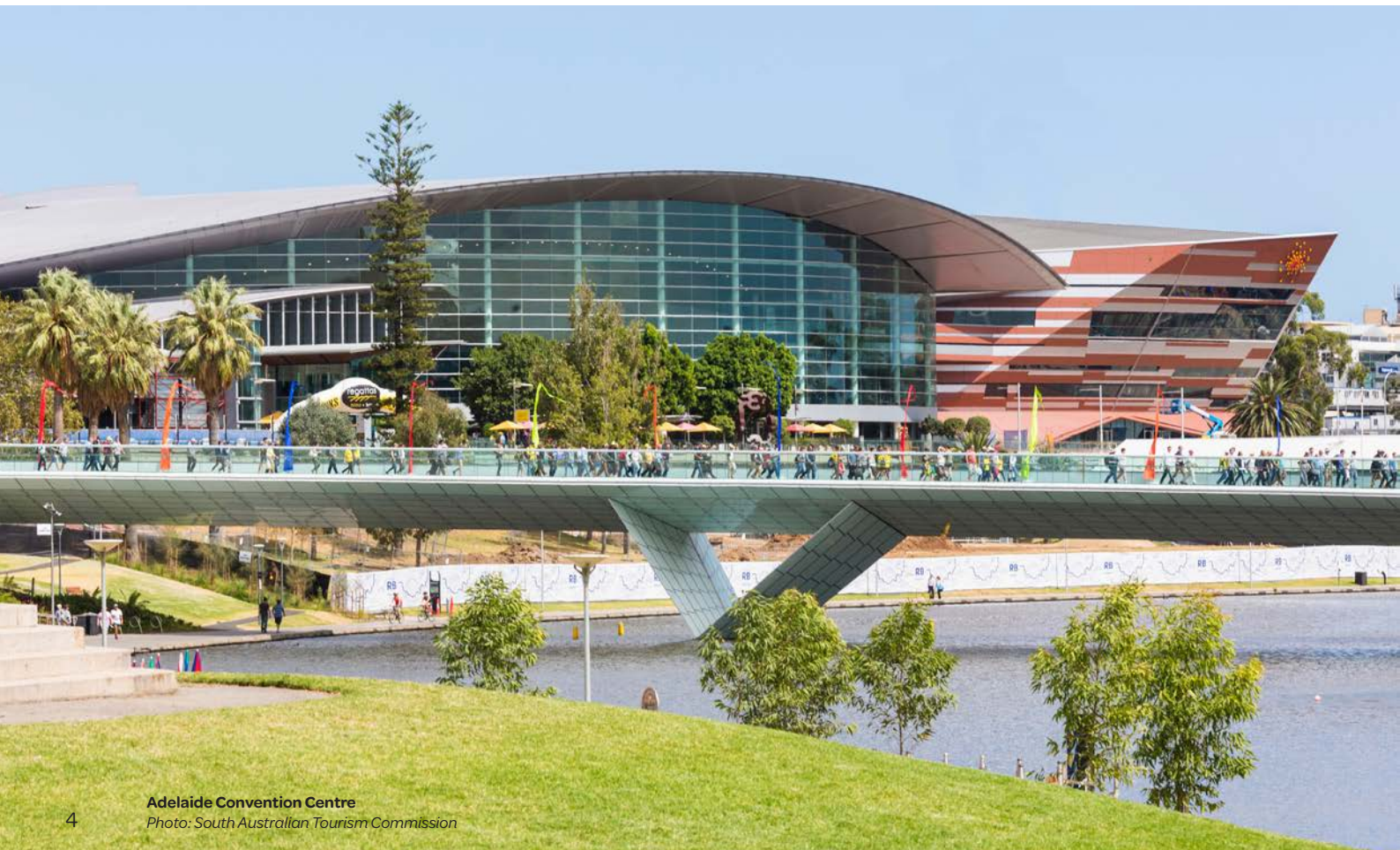
Adelaide Convention Centre