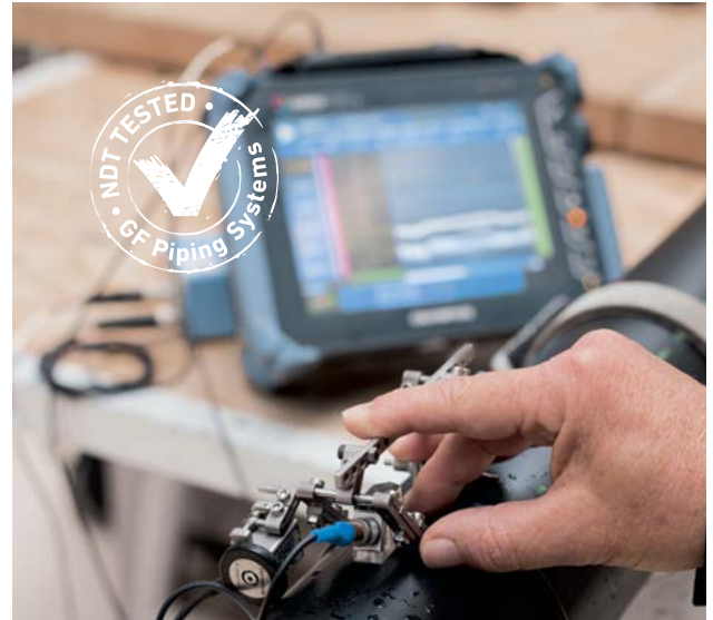
Scan butt fusion welds with our customized ultrasonic sensors

Previously, providing an assertive and reliable quality check for a plastic piping installation was no easy task. A typical pressure test does not provide any information on the long-term performance of the installation, while destructive testing, does not add any certainty about the quality of other welds that are not tested. In our approach to total quality management, we have developed the first Ultrasonic NDT solution for plastics, with a 'pass' or 'fail' statement, regardless of material (HDPE 100, RC, PP) and type of fusion (Butt Fusion, Electro Fusion, Infrared). A solution that enables you the certainty you deserve, when closing a trench or installing a pipe in your plant.