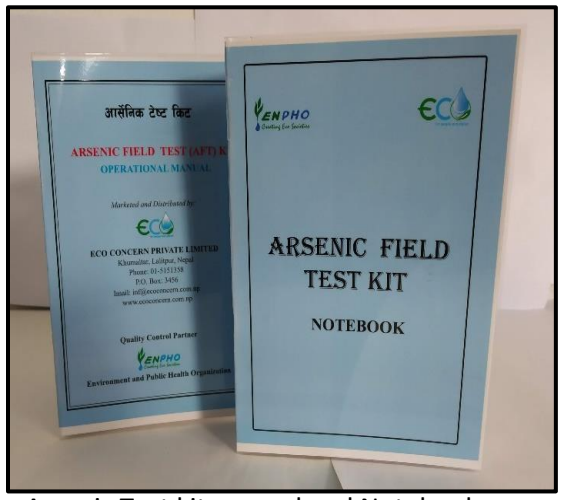
Arsenic Test kit manual and Notebook