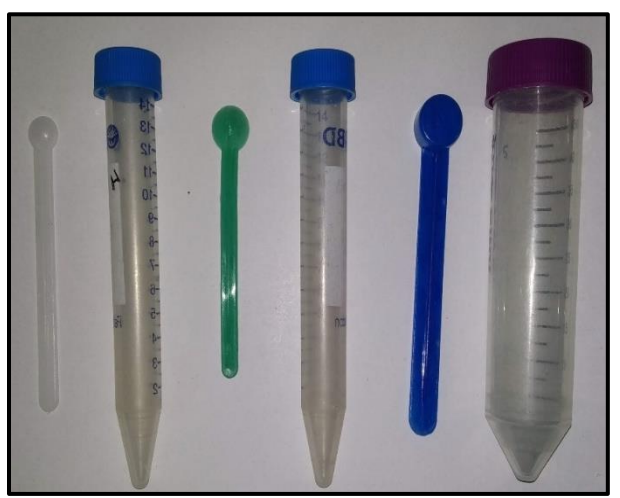
Centrifuge tubes to hold reagent spoons