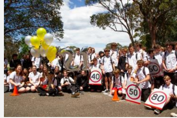
Bridgestone Australia New Zealand