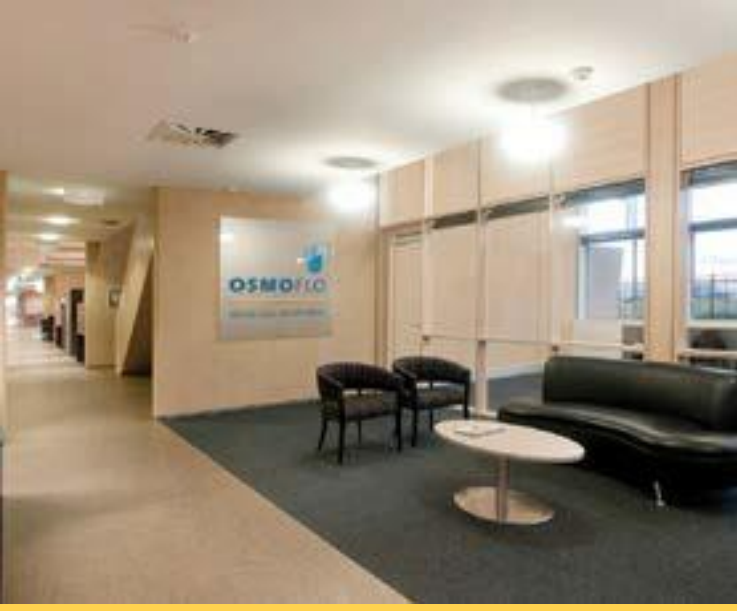
World class facilities