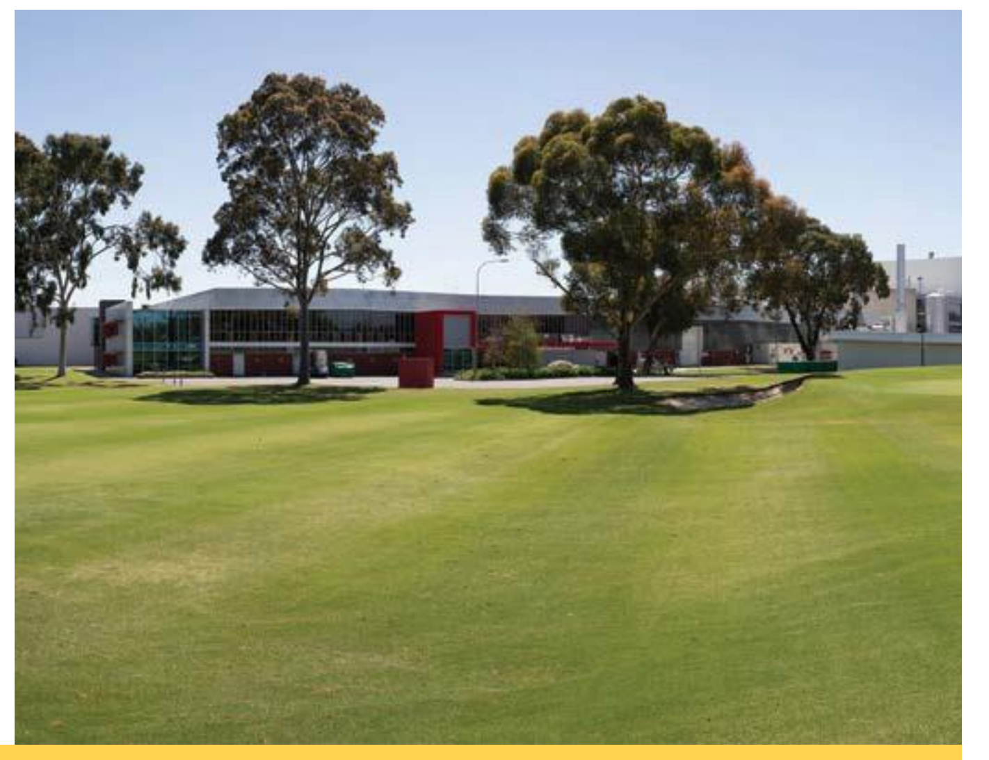
Ground water made suitable for beer production at Coopers Brewery