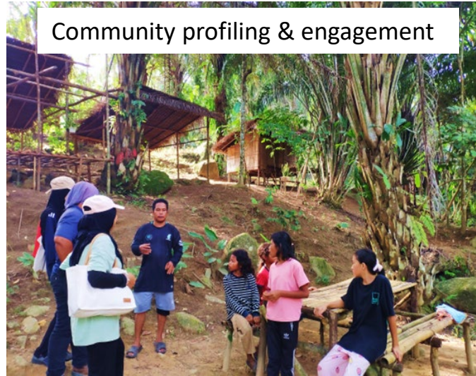
Community profiling & engagement