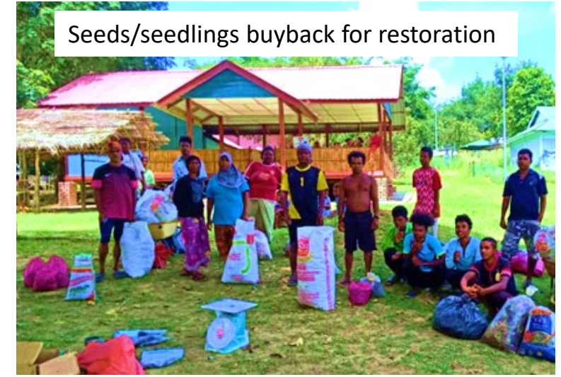
Seeds/seedlings buyback for restoration