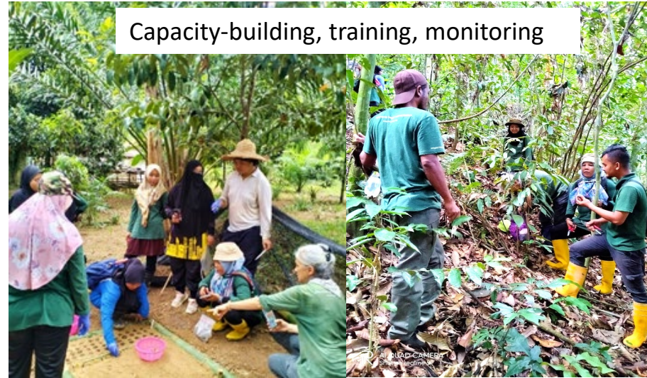
Capacity-building, training, monitoring