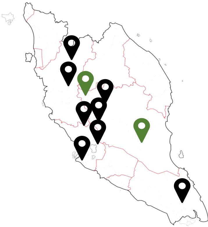
Community nursery clusters in Peninsular Malaysia

💡 Huge potential to link or integrate with the mechanisms set up by the Malaysia Forest Fund (Forest Conservation Certificates), Yayasan Hijau Malaysia (via Greening Malaysia program) and social forestry program. Capacity-building and investment needed to facilitate the formalization of community involvement in the management and use of forest reserves.