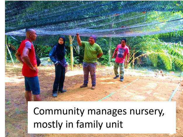
Community manages nursery, mostly in family unit