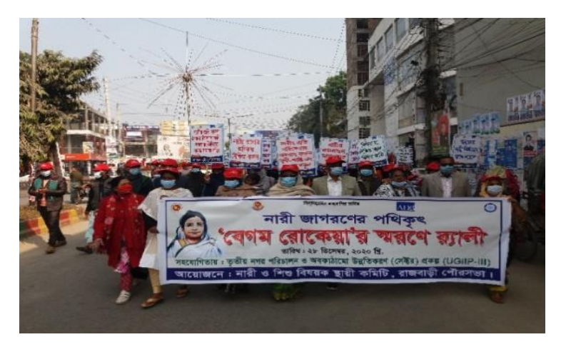
Celebration of Begum Rokeya Day at Rajbari Pourashava