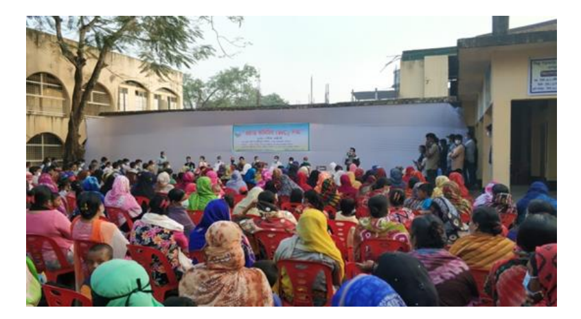
Courtyard Meeting at Khagrachari Pourashava