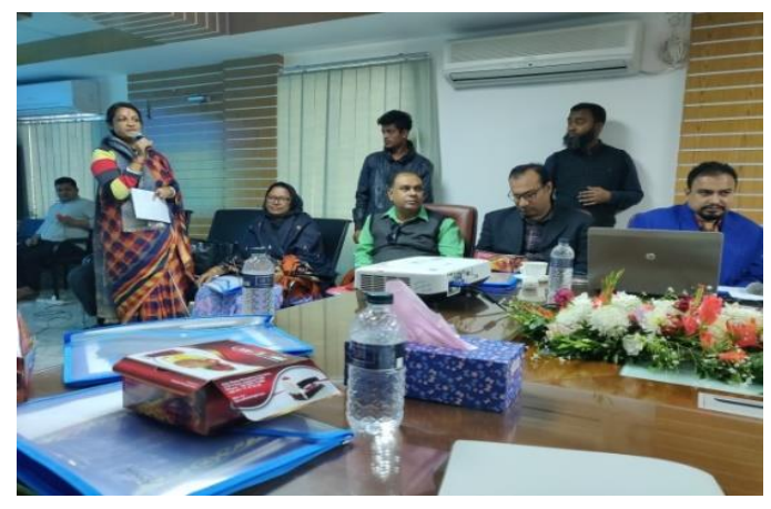
Woman active in TLCC meeting at Jessore Pourashava