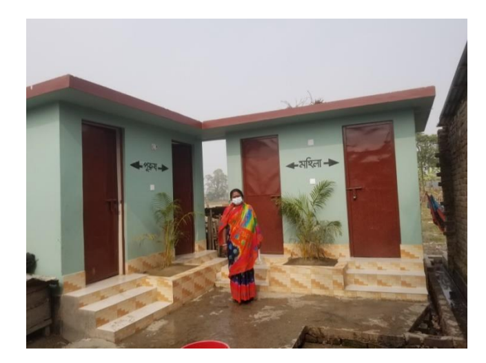
Community Latrine at the Sweeper Colony with separate male and female chambers, Joypurhat Pourashava