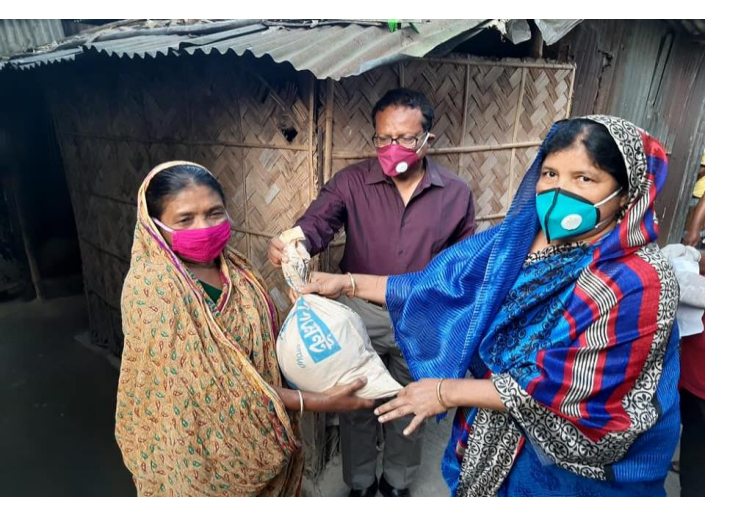
Councilor of Sherpur Pourashava providing food support to poor woman as part of GAP implementation