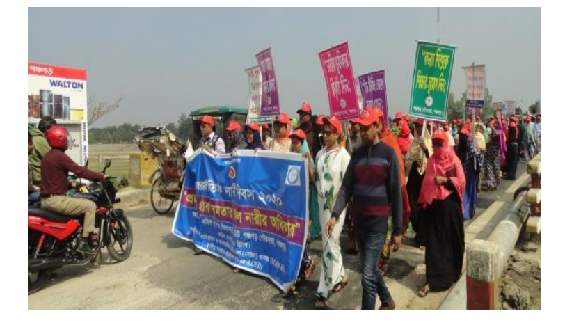
Celebration of International Women Day 2020 by Panchagarh Pourashava