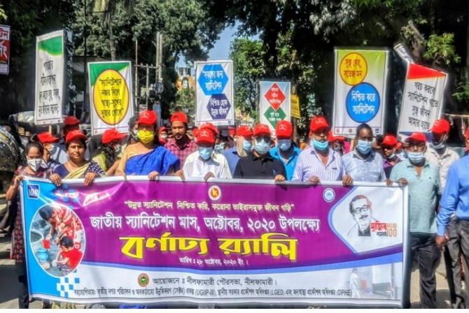
Celebration of Sanitation Month October 2020 at Nilphamari Pourashava