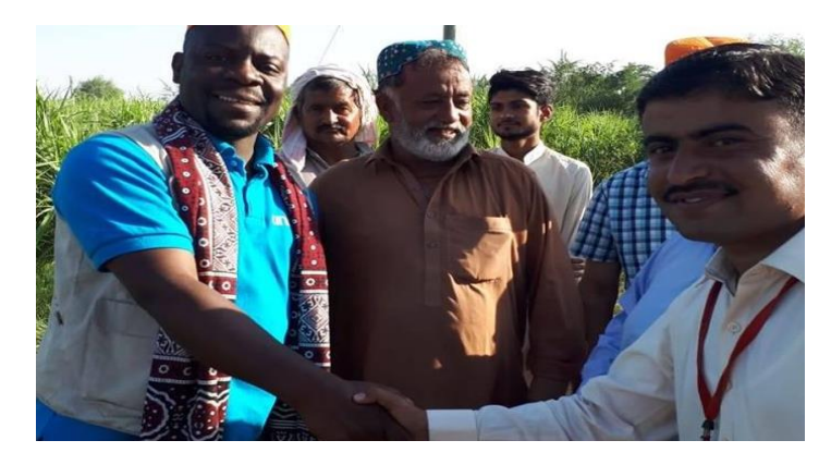
"After studying in an international setting, it was easy for me to adopt to work in Asia."