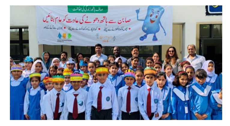
"I am making use of WASH in emergencies course in coordinating COVID-19 response in schools."