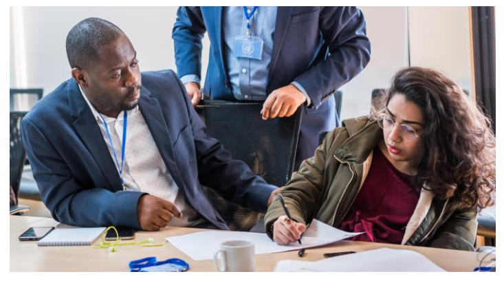
"I realized that all the things I learned during my study are now applicable in the field."