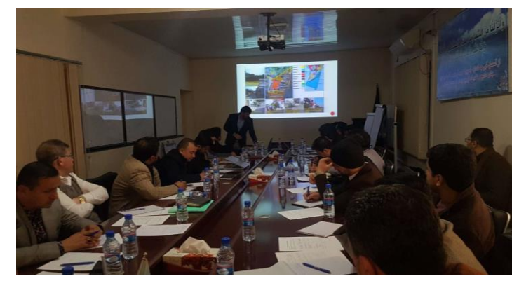
"After graduation I became responsible for CWIS plan for 5 cities in Afghanistan"