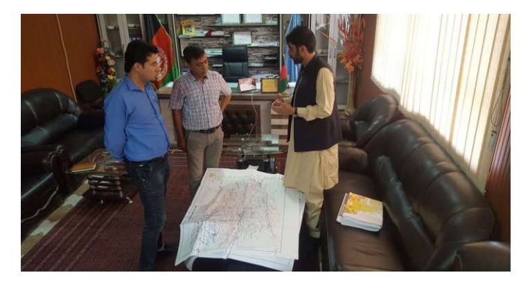
"I used the knowledge from both thought and research part of my study in a real life settings."