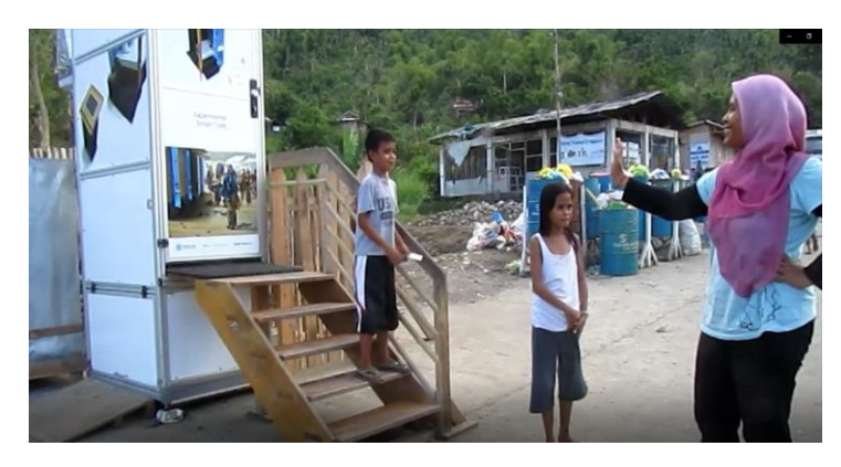
"I tested a novel eSOS Smart Toilet in Tacloban, Philippines supported by ADB and BMGF."