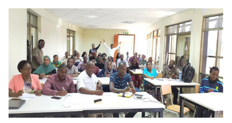
"As a dean of the faculty, I am committed to deliver at least 200 MSc graduates in CWIS under the GSGS framework."