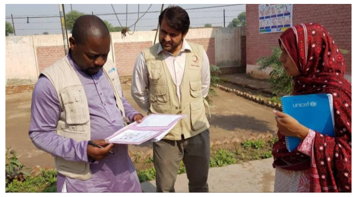
"Behavior change course is invaluable in my current work in eliminating open defecation in Pakistan."