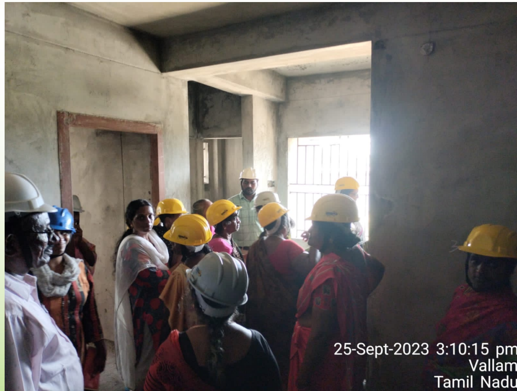
25-Sept-2023 3:10:15 pm Vallam Tamil Nadu