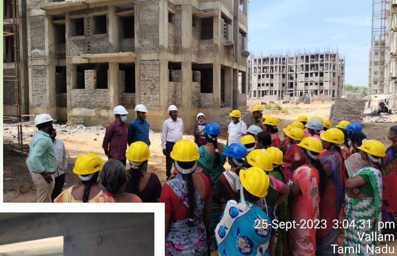
25-Sept-2023 3:04:31 pm Vallam Tamil Nadu