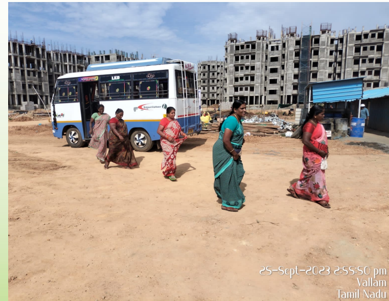
25-Sept-2023 2:55:50 pm Vallam Tamil Nadu