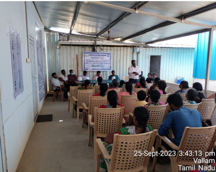
25-Sept-2023 3:43:13 pm Vallam Tamil Nadu