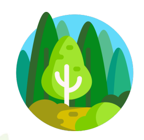
1,955 hectares degraded forest rehabilitated