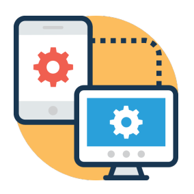
Skills in Technology