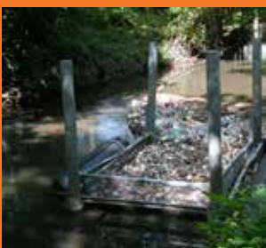
ENHANCER Series (With Basket)