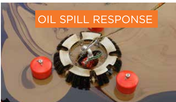
OIL SPILL RESPONSE