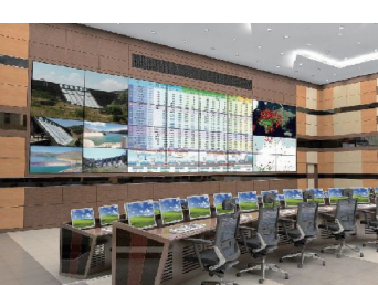
IWRM Projects in Algeria