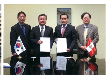
MOU with Peru,technical cooperation in the water resources management