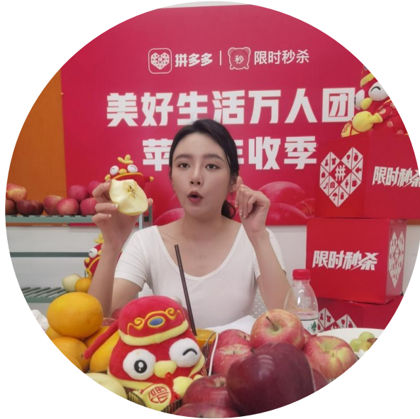
Apple Golden Week Livestream