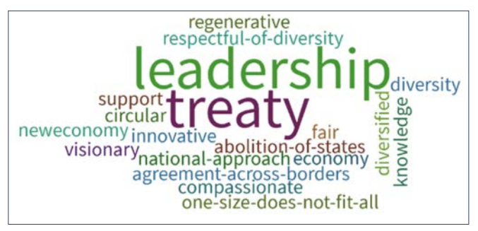
Word cloud 2: Vision for a sustainable future nationally

Treaty refers to a desire for a formal agreement between the Australian government and Indigenous people that would have legal outcomes. This treaty could recognise Indigenous peoples' history and prior occupation of the land, as well as the injustices that many have endured