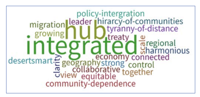
Word cloud 1: Vision for a sustainable future in Alice Springs

The most popular answers to the question 'What is your vision for a sustainable future nationally?' were leadership, treaty and diversity/diversified, with two entries each. Participants emphasised that local governance was needed at the appropriate scales, as national initiatives might not suit the particular needs of Alice Springs. Diversity referred to the varied population that already exists in Alice Springs, with a large Indigenous community, while also reflecting current and future immigration from Eurasia to the Alice Springs region.