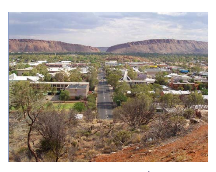
Figure 1: Aerial photo of Alice Springs

While the township of Alice Springs is not, most land in the Alice Springs region (and the Northern Territory in general) is tenured by the traditional landowners, concurrent with underlying native title status (Austrade, 2019) (Figure 3).