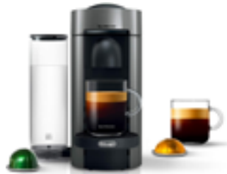
Note: Model may vary.

Visit the WSPS Booth for your chance to win a Nespresso Machine!