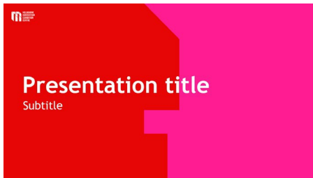
16:9 ratio presentation on 16:9 screen

Please note that all MCEC meeting rooms are equipped with 16:9 aspect ratio (widescreen) screens. Before creating your presentation check that the slide size is set to 16:9 ratio. This is to ensure your PowerPoint presentation looks its best and fills the entire screen.