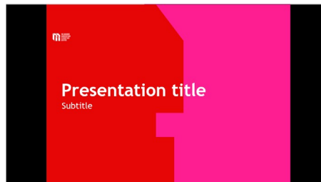
4:3 ratio presentation on 16:9 screen