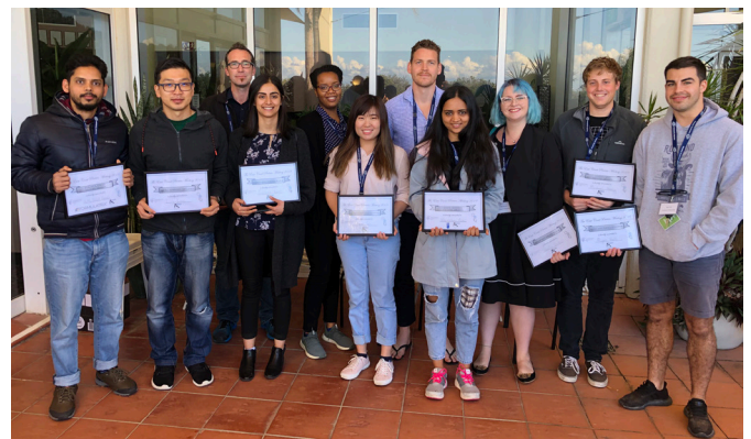
2019 East Coast Protein Meeting student and postdoctoral prizewinners.

In November 2021, the QPG will be hosting a local student and postdoctoral awards symposium (details to be announced). Most importantly, QPG is keen to bring new young scientists to the Executive and Organising Committee of our Special Interest Group. The symposium will be an opportunity to elect new office bearers, and to bring more people into the regular committee so we will be very keen to hear from people interested in taking on these roles to continue the QPG traditions and activities into the future.