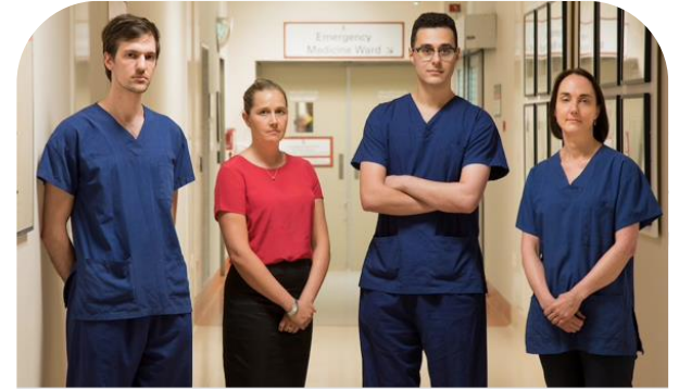
Mental health issues killing young doctors thewest.com.au