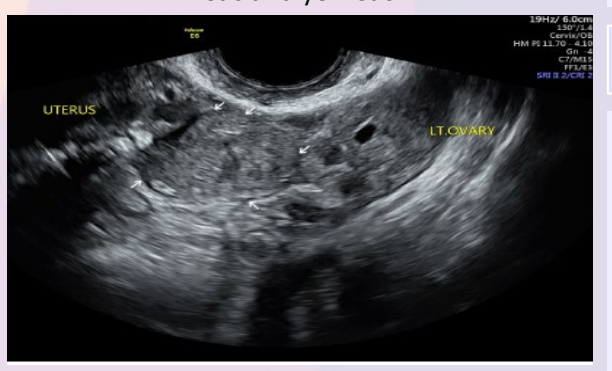
Figure 2. Ultrasound: left adnexal mass