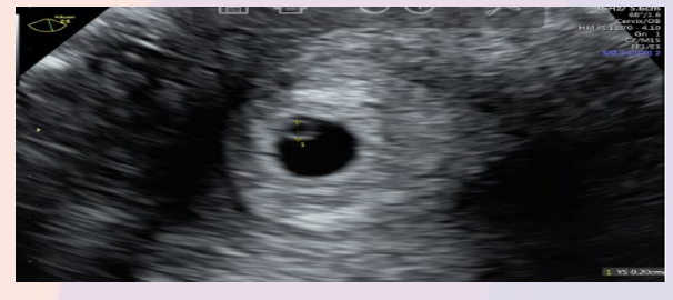
Figure 1. Ultrasound: intrauterine gestational sac and yolk sac

Transvaginal ultrasound showed an intrauterine gestational sac and yolk sac with no foetal pole, left adnexal avascular mass (29x26x22mm) between left ovary and uterus, heterogeneous region adjacent appearing like congealed blood (40x38x22mm), and large pelvic free fluid (52x31x28mm).