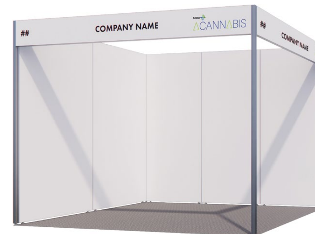
Note: Artist impression only