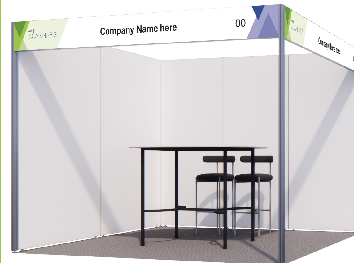
Note: Artist impression only