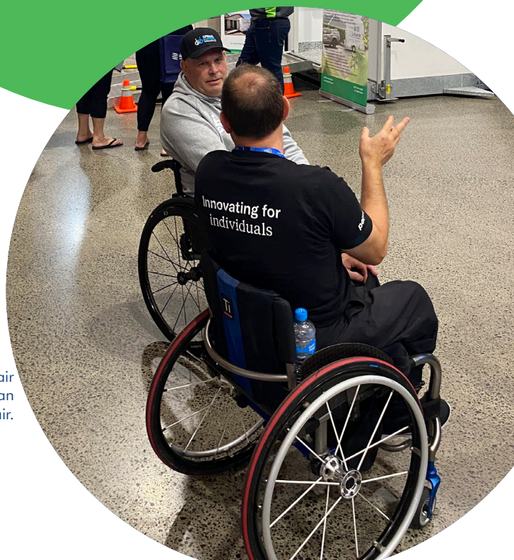
Expo attendee in a wheelchair having a discussion with an exhibitor, also in a wheelchair.