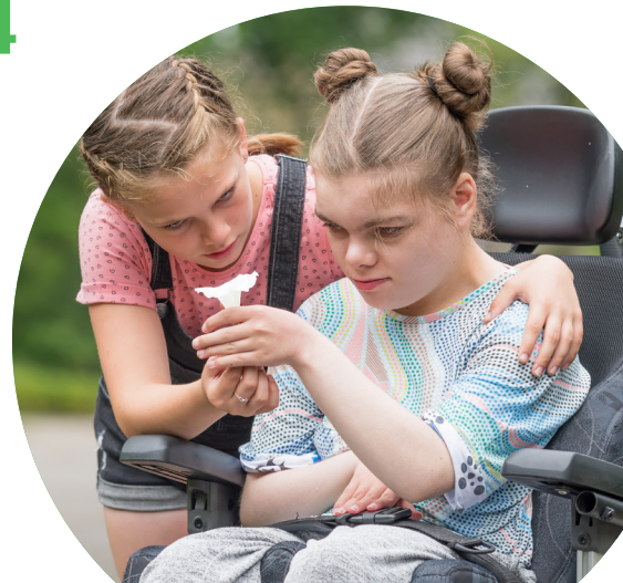
Two children, 1 in a power wheelchair both holding onto the same flower, engaged in conversation

Airforce Museum of New Zealand, Wigram, Christchurch