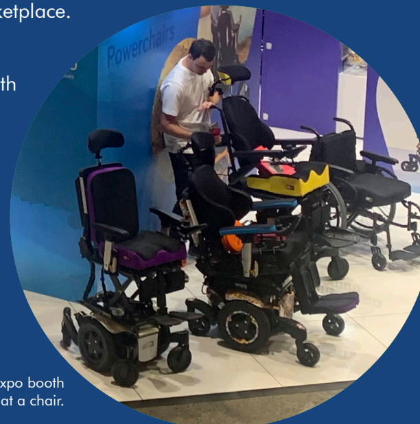
Power wheelchairs on an Expo booth with a person looking at a chair.