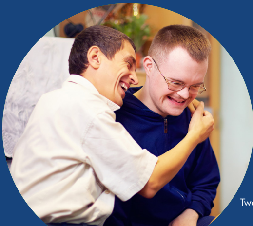
Two people laughing and embracing.