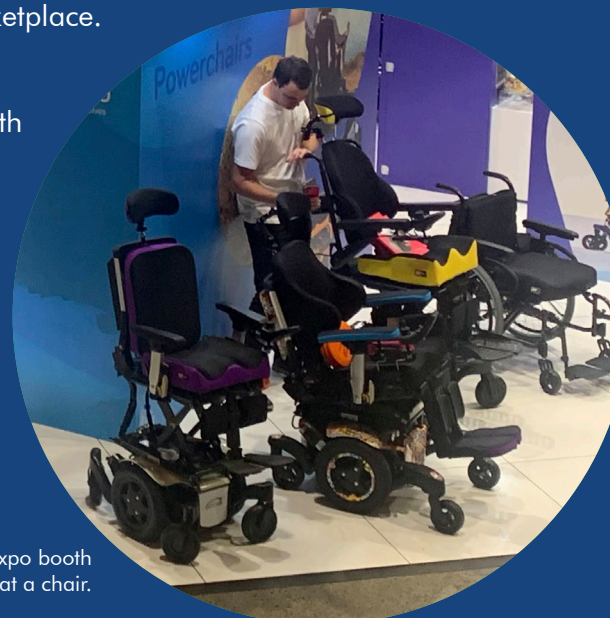
Power wheelchairs on an Expo booth with a person looking at a chair.