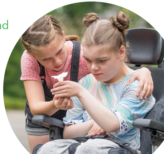
Two children, 1 in a power wheelchair both holding onto the same flower, engaged in conversation

Due Drop Events Centre, Manukau, Auckland