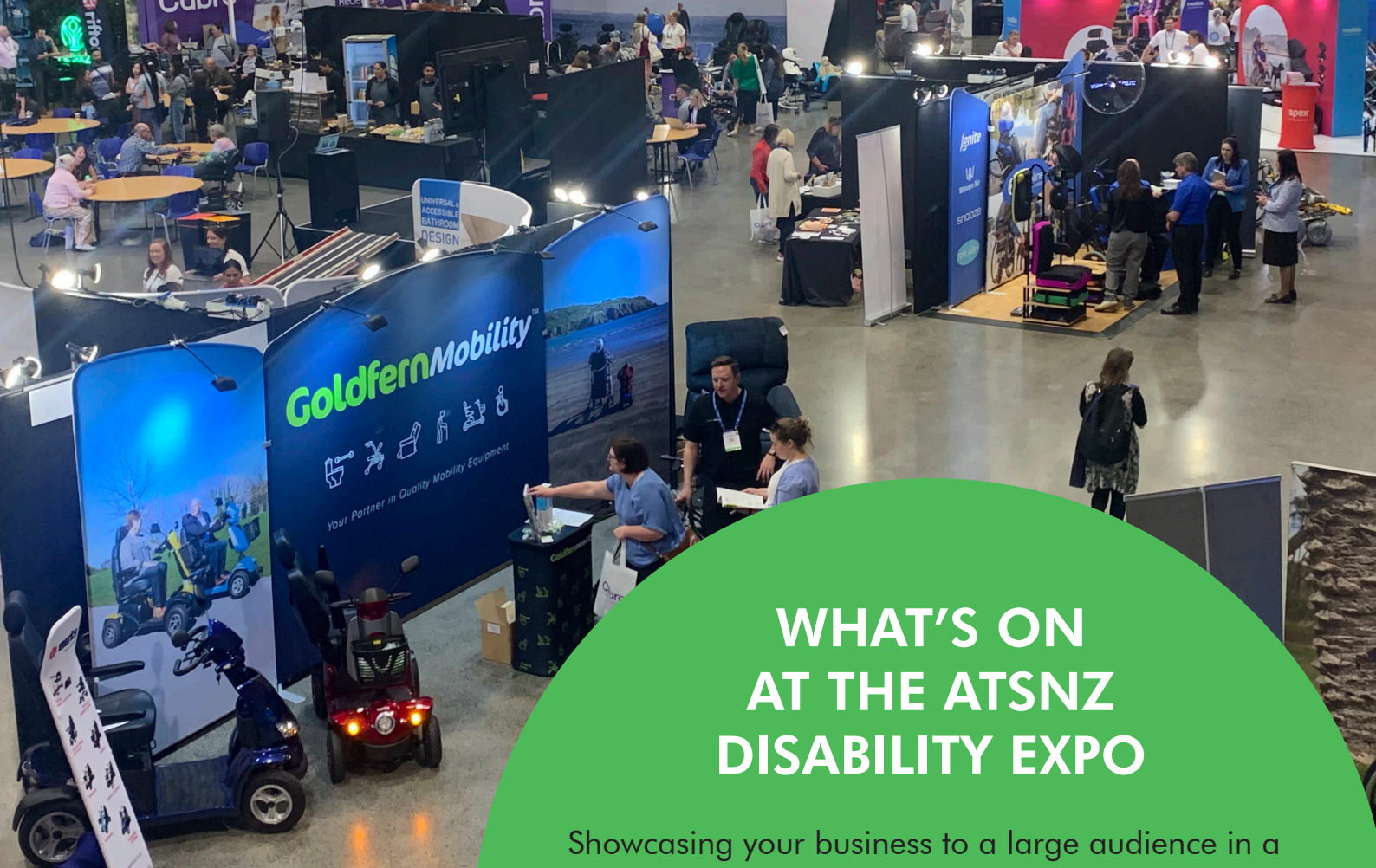
Wide angle of the Expo floor, with various exhibitor booths displaying equipment, and attendees looking around the booths.