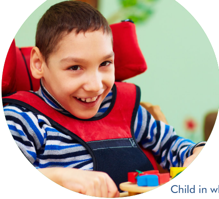
Child in wheelchair