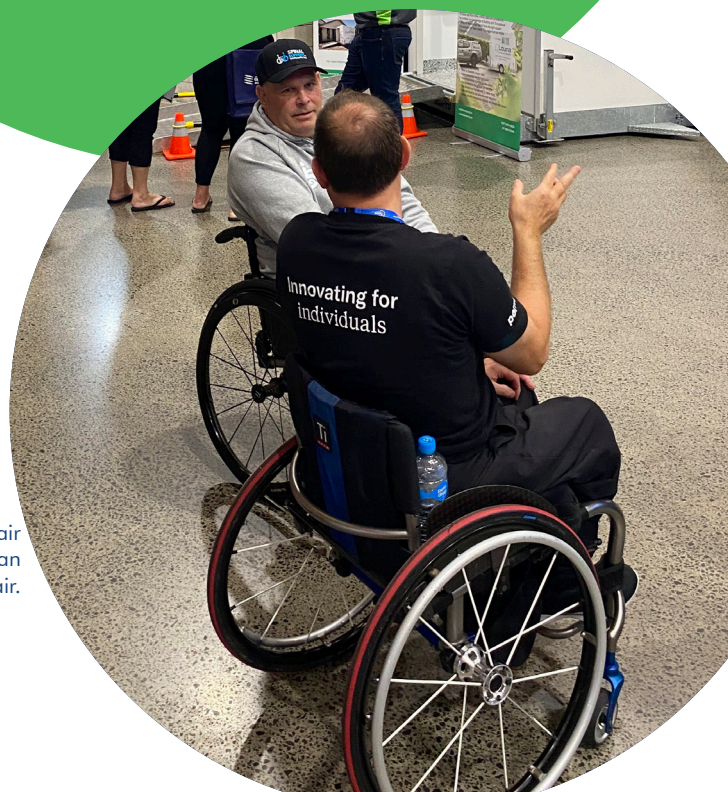
Expo attendee in a wheelchair having a discussion with an exhibitor, also in a wheelchair.