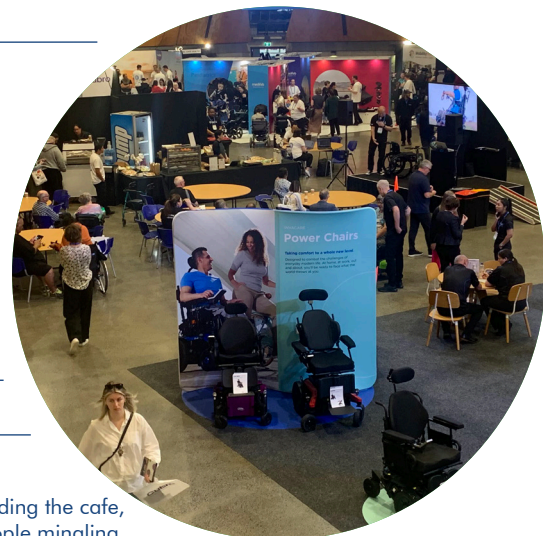
High angle image of the Expo floor including the cafe, power wheelchairs on display and people mingling.