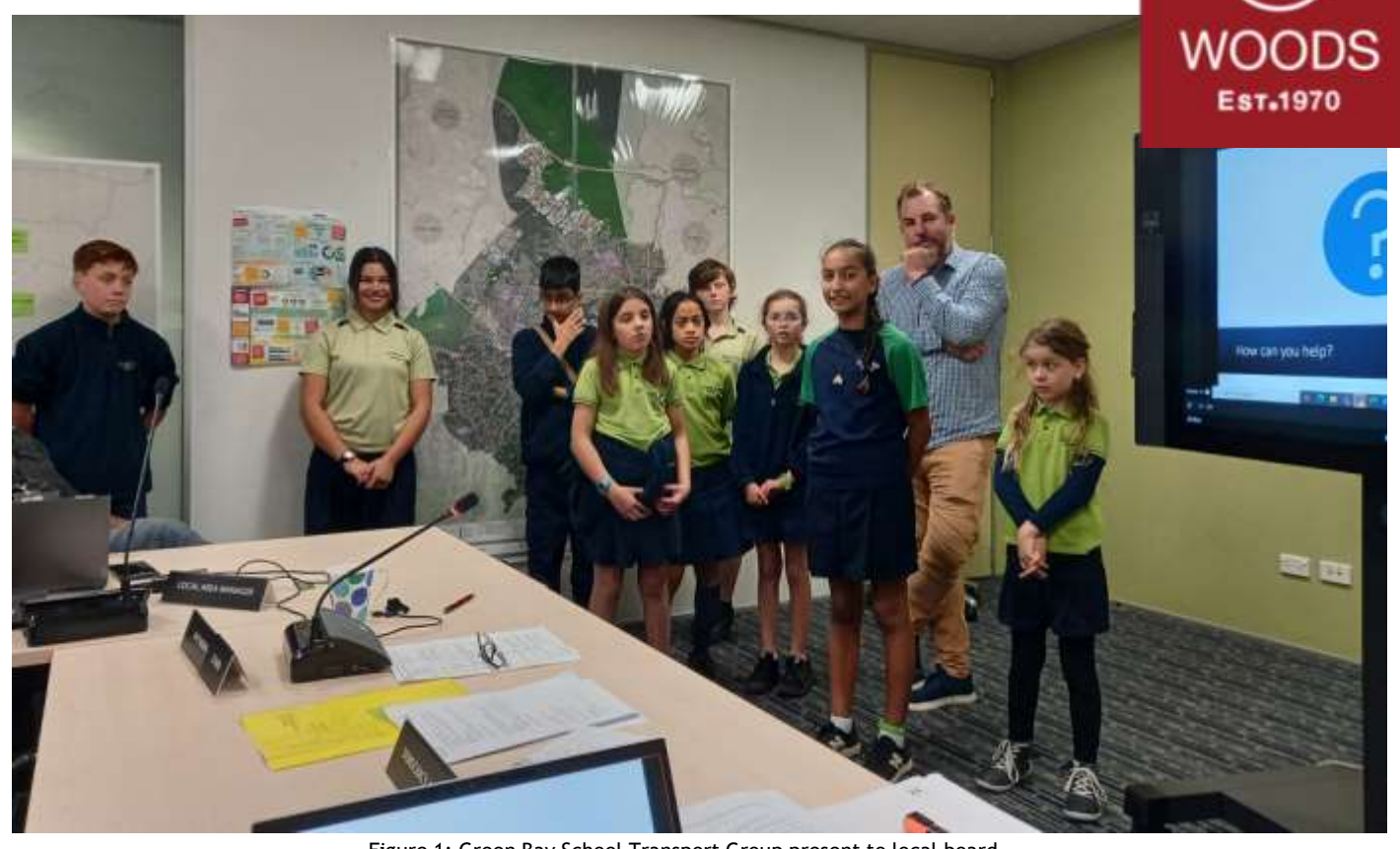
Figure 1: Green Bay School Transport Group present to local board

Aim was to identify ways we could improve the transport issue for the school.