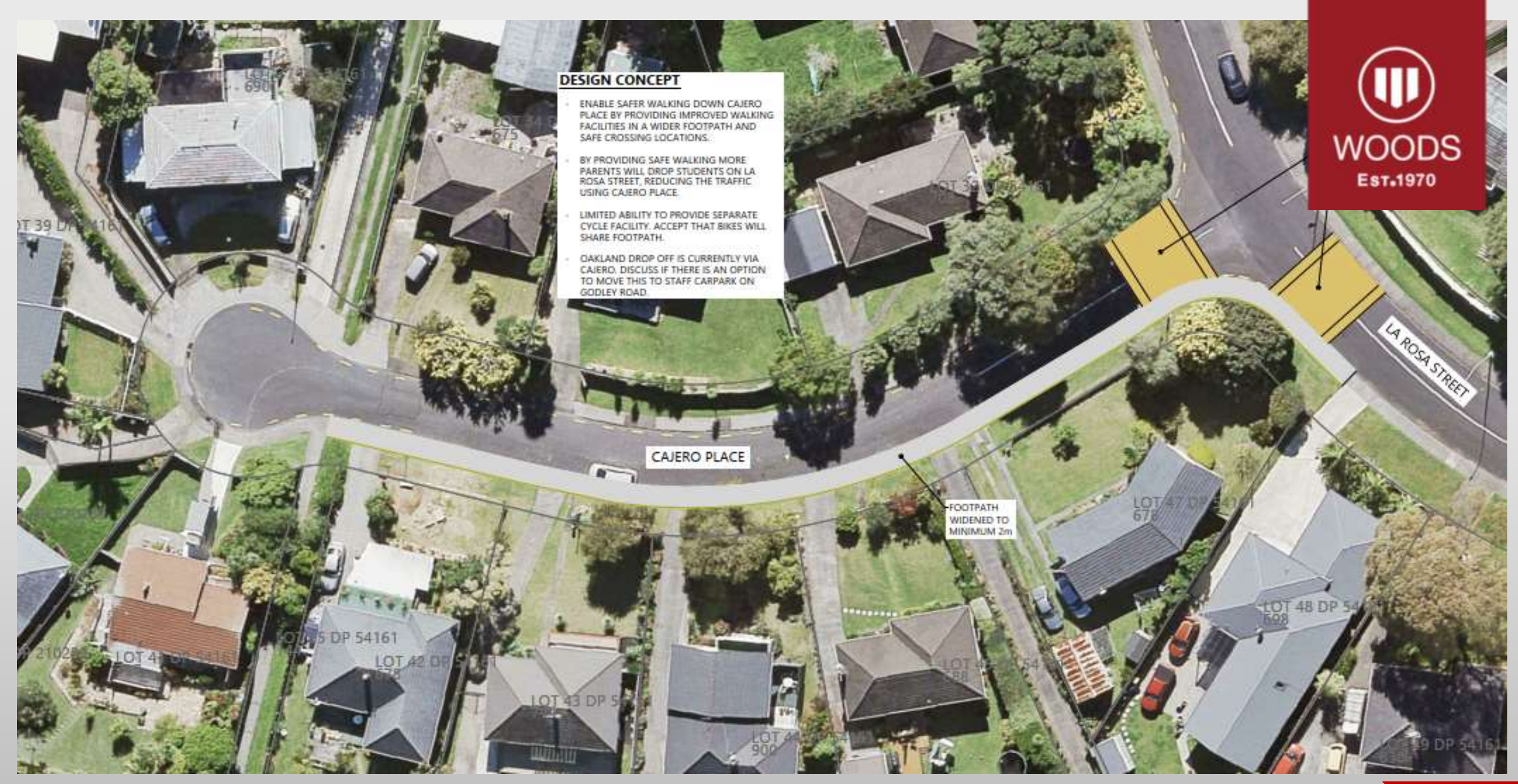
Green Bay School - Transport Plan