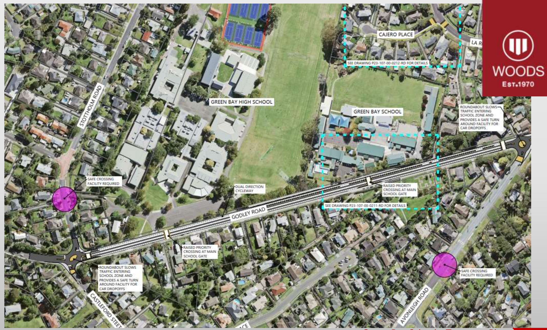
Green Bay School - Transport Plan