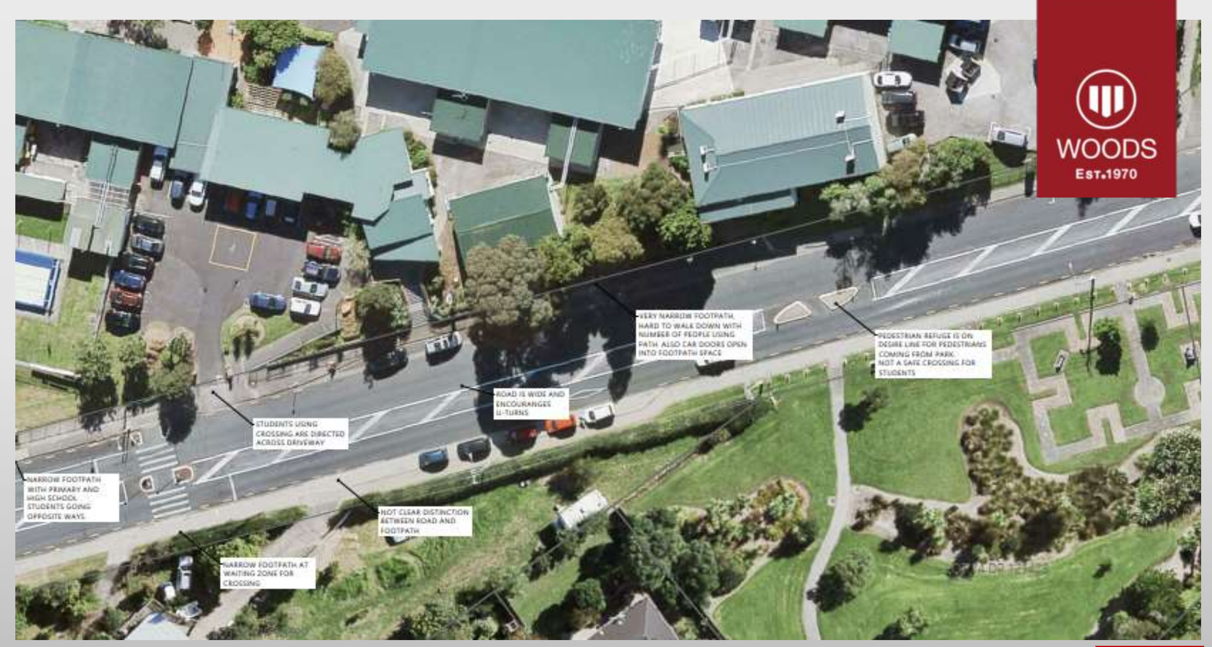
Green Bay School - Transport Plan