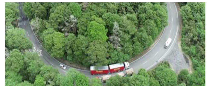
Northbound vehicle close to the cut face