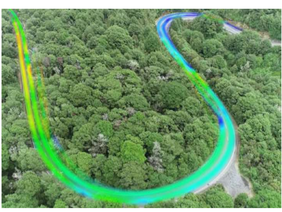
Light Vehicle Heavy Vehicle