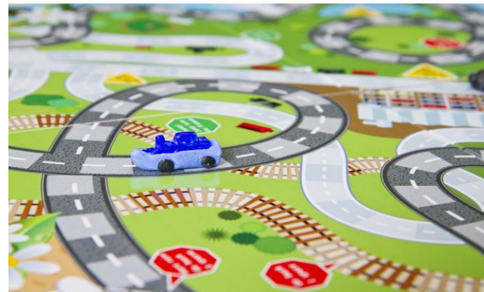
Compliance support, Driver training