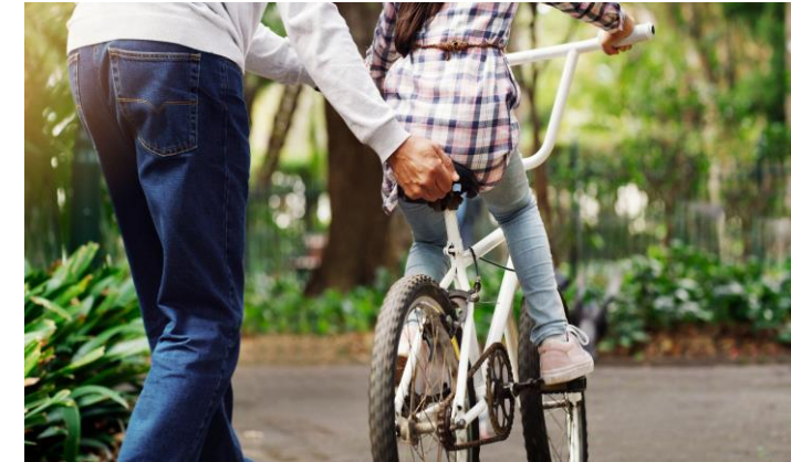
Family support Generational shift