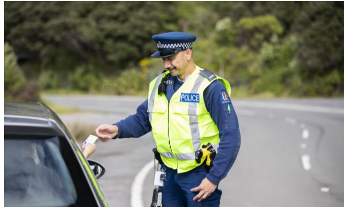
Supported resolutions Compliance