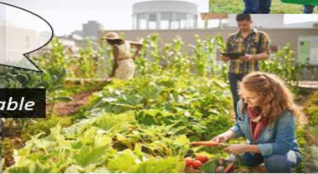
"Best crop ever from Gate Pa Community Centre"