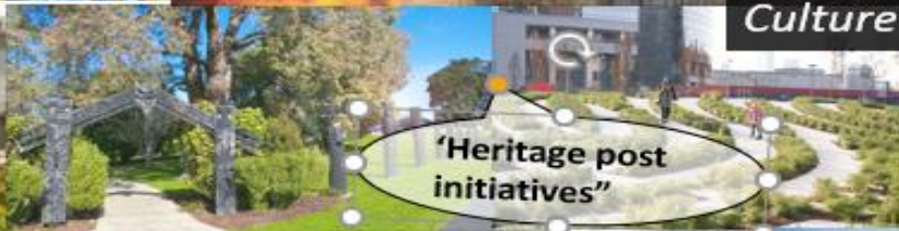
"Heritage post initiatives"