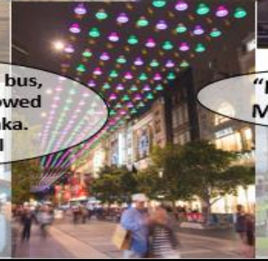
"Rare moment! Man uses car"