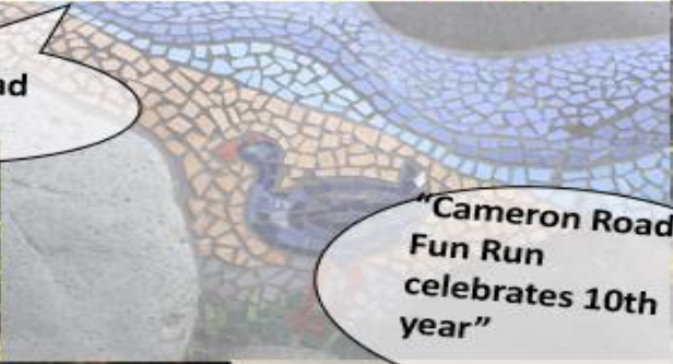
"Cameron Road Fun Run celebrates 10th year"