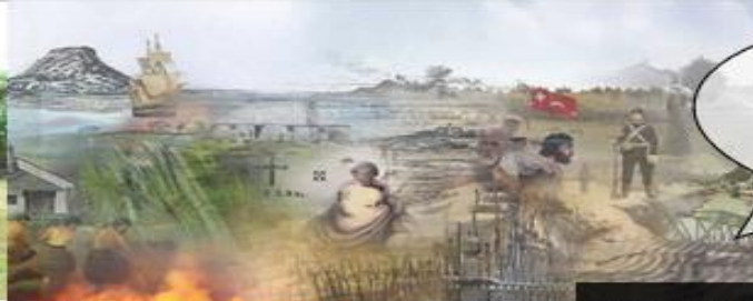
"New Cameron Road Community Gardens provides links to the Past"