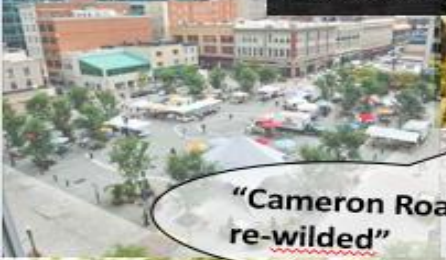
"Cameron Road re-wilded"