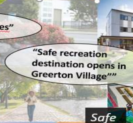
"Safe recreation destination opens in Greerton Village"