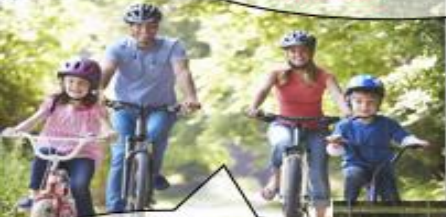
"From most car dependent city to least in 18 years"